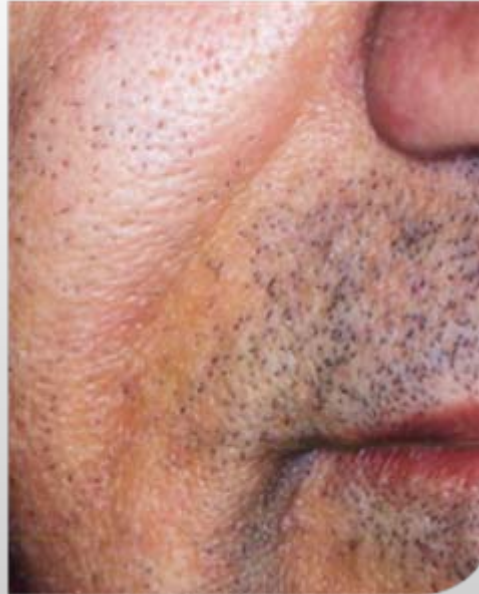
After 6 Months