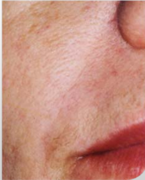
After 6 Months